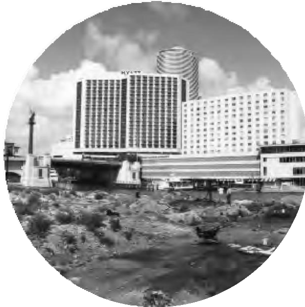
Miami Circle Excavation

In 1998 at a construction site on the Miami River in downtown Miami, archaeologists discovered the “Miami Circle.” They found a circle of deep holes in the bedrock spanning 38 feet that dated back over 2,000 years ago. Based on artifacts found during the excavation, archaeologists believe the Tequesta built the structure for ceremonial or political purposes. The State of Florida and Miami-Dade County purchased the land, and archaeologists are still working to piece together the puzzle of the mysterious civilization that once called South Florida home.