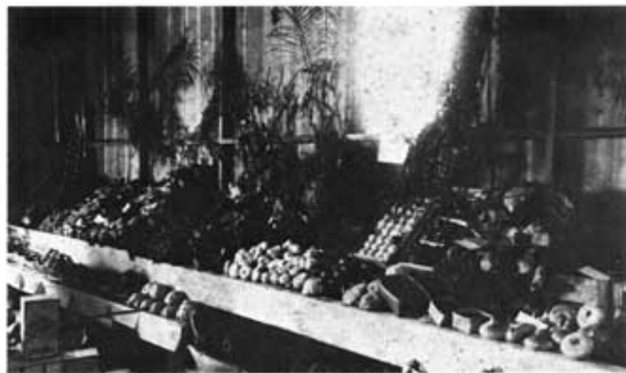
The interior of the Budge Opera House during the Fair in 1901. Fresh produce and canned and packaged goods were exhibited side by side. The building was located on what is now Flagler Street.

Seminole Club—once the home of Julia Tuttle and before that Miami's most famous early landmark, Fort Dallas. The Club grounds were designated as the viewing area. According to the press there was standing room only, with many of the people attending all three nights, for the sound and fury of battle was too much to resist. When the last bomb had exploded and the last rocket died away a glorious pyrotechnic American flag appeared above the castle to send the cheering spectators back to their hotels and homes.