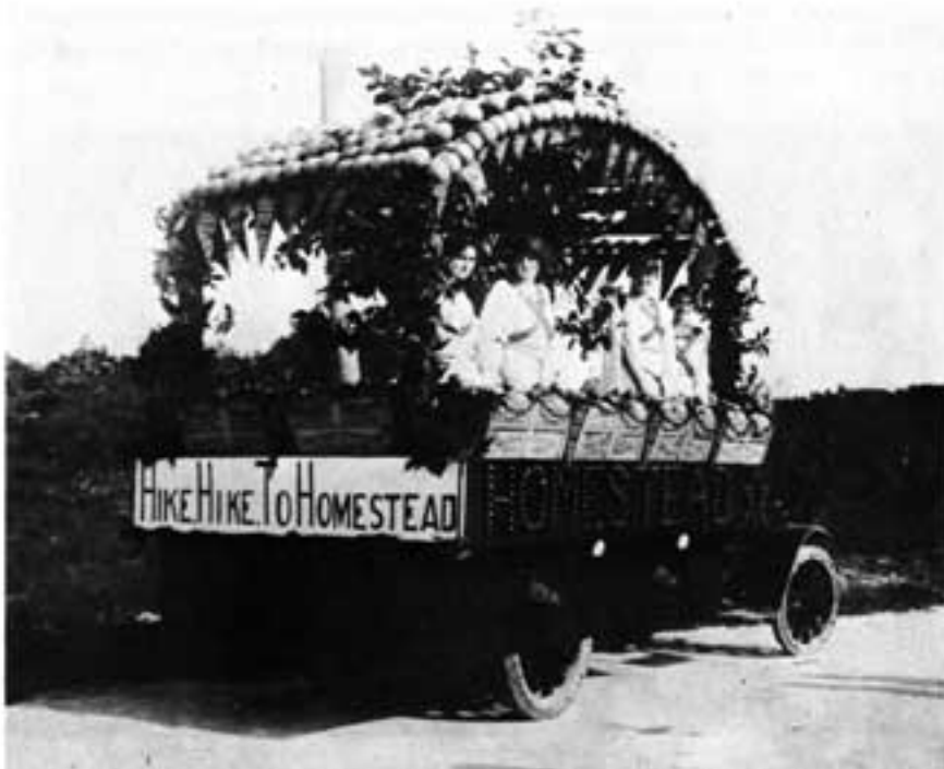
In 1915, the Redland District sent this float to the Dade County Fair. The four girls riding on the float, Anice Hayes, Chloe Flora, Bessie Deeden Harris and Alice Kahl Lutz, threw grapefruit to the crowds.

The vacant lot next to the Chamber of Commerce on Krome Avenue was cleared, scarified and covered with sawdust before the 70x200-foot tent was erected. The pyramid at the entrance, 29 feet high and 20 x 20 feet at the base, was formed of grapefruit of uniform size and color on the front, oranges on the back and tomatoes and bell peppers on the other sides. A sign made of fruits on each side of the pyramid spelled out "Redland District