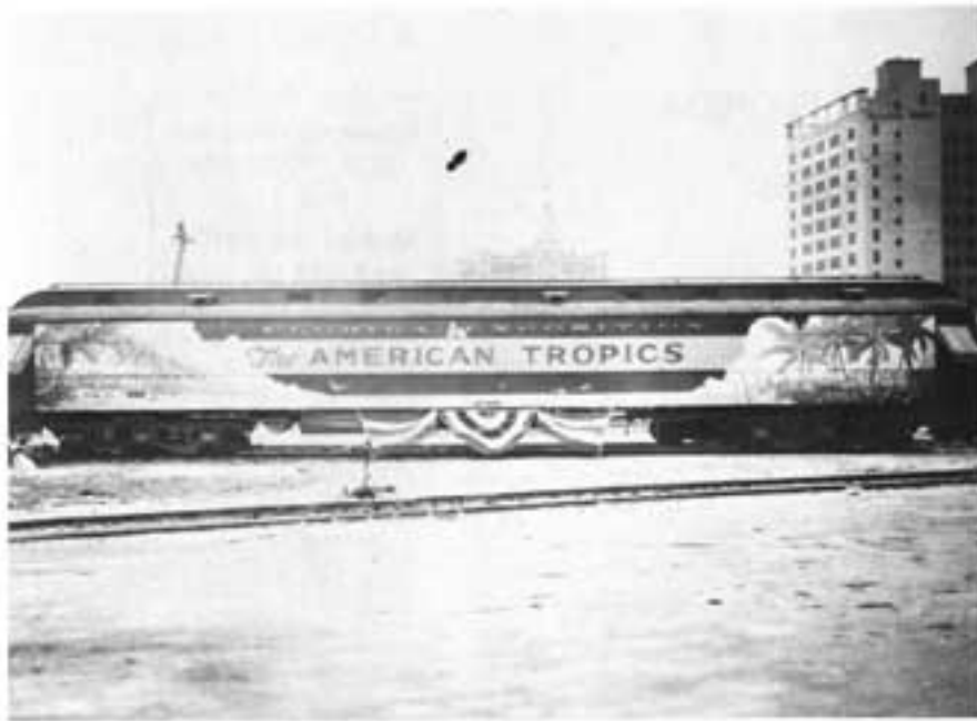
As part of the Florida Exposition Train, three railroad coaches left Miami in mid-March of 1927 on a two-month tour of northern and midwestern cities advertising the agricultural and industrial advantages of "The American Tropics."