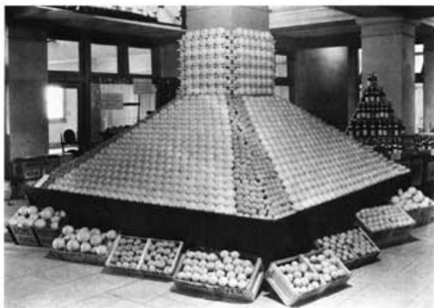
The exhibit presented by the Indian River Citrus Growers League of Fort Pierce featured a pyramid of grapefruits and oranges. The show was at the Miami Biltmore Hotel, January 14, 1932.