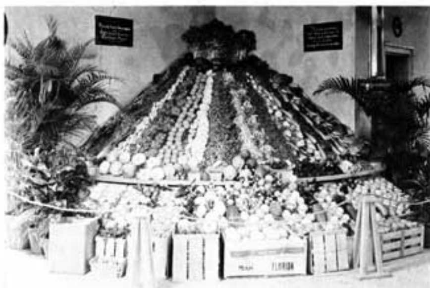
Florida State Agriculture Department display January 14, 1932, at the Miami Biltmore Hotel. The sign on the right wall reads "Florida produces and ships a carload of fruits and vegetables every minute during the winter months."