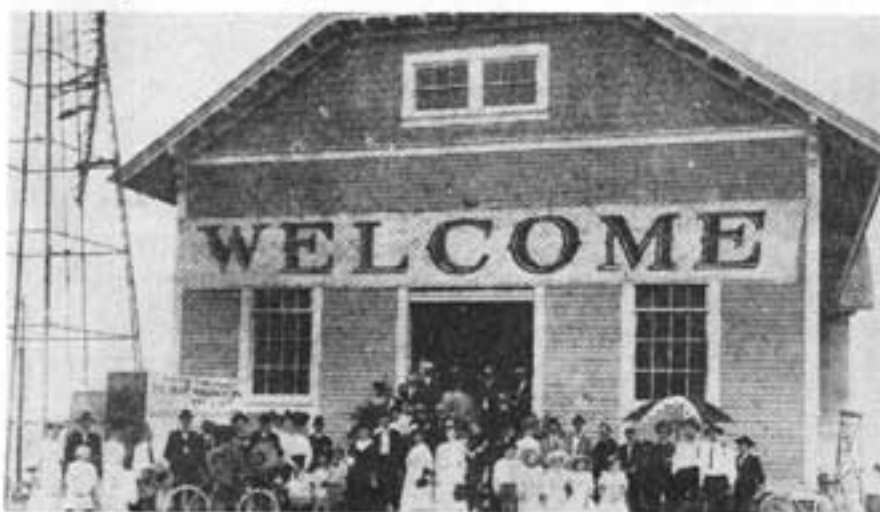
The 1907 Dade County Mid-Winter Fair was held in the permanent fair building given to the county by Henry M. Flagler. It was built at the Stone Dock on the bayfront at Flagler Street. Local residents could tell the forecast by what kind of weather flag was floating from the steel tower at the left. This photo of Fair visitors was taken March 14, 1907.

In September 1926 the great hurricane struck and laid waste the fields of South Dade. Grove owners had hardly righted their fallen trees when another storm in October laid them back again. Vegetable fields already planted had to be replanted or abandoned. By March 1927 all thoughts of a fruit festival were forgotten, as what little fruit was available was commandeered for the Dade County Fair. In 1928 Homestead's only two banks closed their doors, and there were more important things to worry about than fruit displays. By 1929 the groves and fields were bearing well, and the festivals were resumed. They ran through the depression years and through World War II. The last fruit festival was under the chairmanship of Sylvester Adair in 1948.