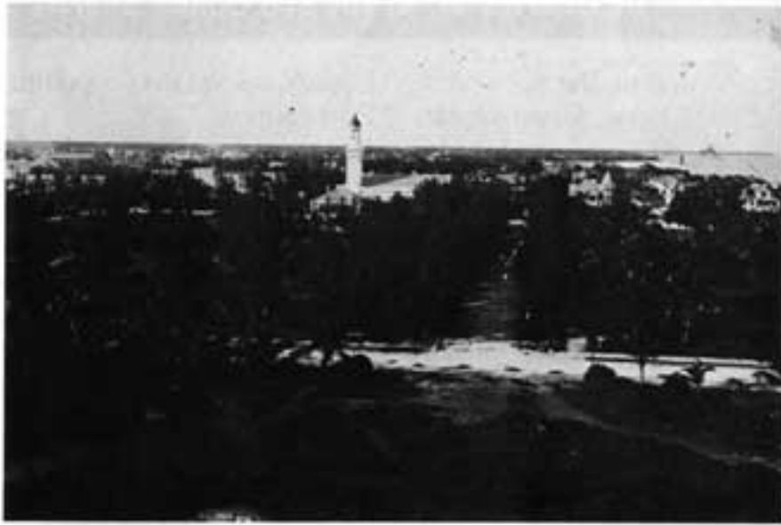
The 1902 Fair was held in a tent located on the grounds of the Royal Palm Hotel. The actual site was at the present Flagler Street and N.E. Second Avenue where Walgreen's is. At that time the hotel grounds extended to that intersection. A highlight of the 1902 Fair was the Battle of Santiago.