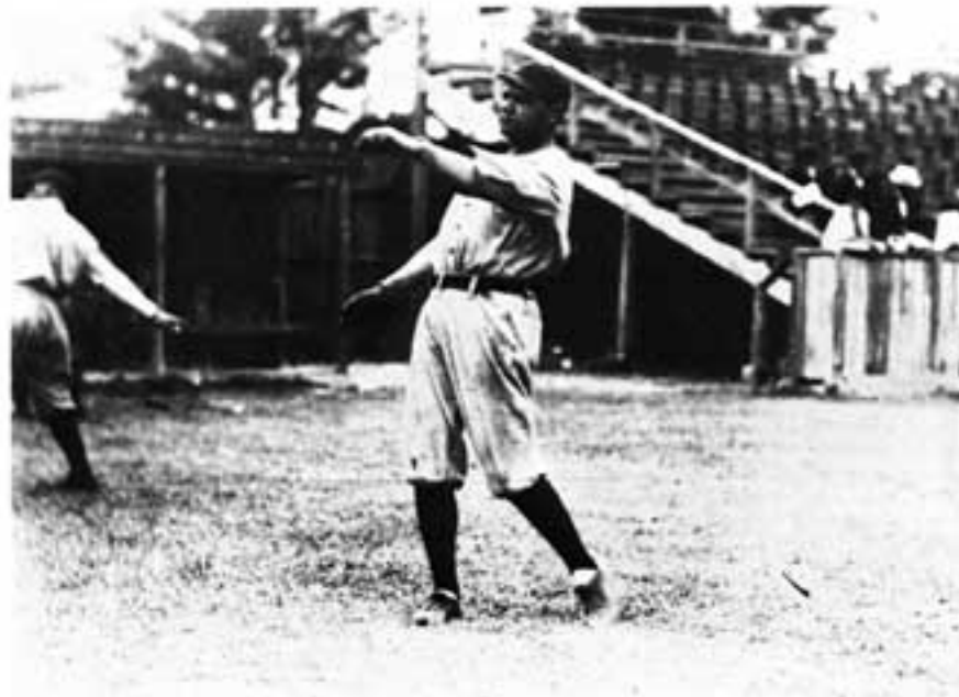
Yankee great Babe Ruth played baseball at Miami's Tatum Park on March 16, 1920. The New York team (above) was opposed by the Cincinnati Reds. Tatum Park (below) in Miami's northwest section was named after the Tatum family, real estate developers. The Riverside subdivision was a Tatum development.