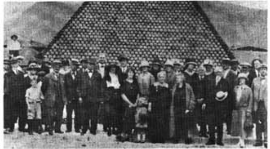
The First Annual Redland District Fruit Festival was held in 1924, one week before the Dade County Fair. A professional celebration promoter was hired to manage the Fair and in addition to displays, the program included concerts, vaudeville contests, dancing and an automobile door prize. The entrance pyramid was made of oranges, grapefruit, tomatoes and bell peppers.

By 1924 the Redland District Chamber of Commerce