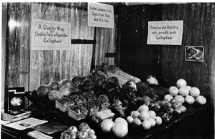
Cellophane "a quality wrap" that provides "protection plus visibility" was the featured item at this display by New York's DuPont Cellophane Company at the 1932 agricultural exhibit. The eggplants, corn, tomatoes, celery, lettuce and citrus on display were Florida grown.