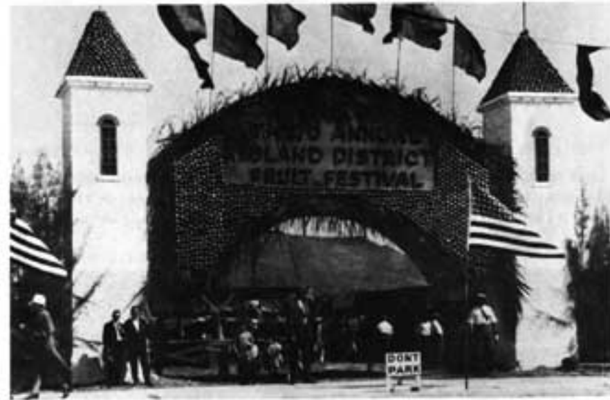
The entrance display for the 1926 Fruit Festival featured "orange" writing, grapefruit background and avocado green and orange colored flags. The Fair was advertised in Miami by a steam calliope and over 10,000 people visited the exhibits.

The Fruit Festival had become such an attraction that many northern states sent groups to visit. On Thursday 200 came from Indiana, on Friday 350 came from New England and 200 from the Carolinas while Saturday brought 300 from Illinois and 400 from New York. Extra buses were chartered to bring the throngs from Miami. The type of commercial displays