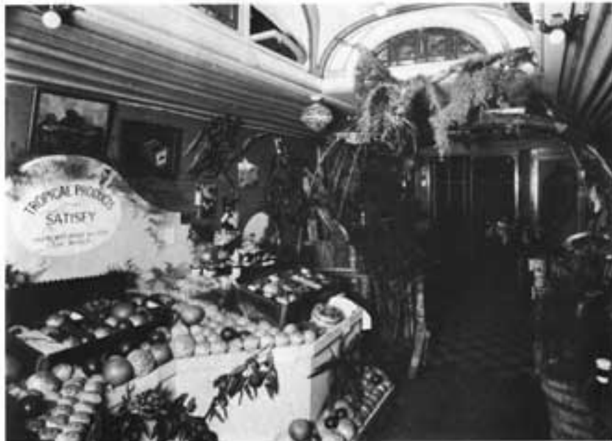
"Tropical products that satisfy." Strange and exotic fruits such as avocados and mangos from the Redlands shared the spotlight with guava jelly and candies. "Shipments made all over the world."