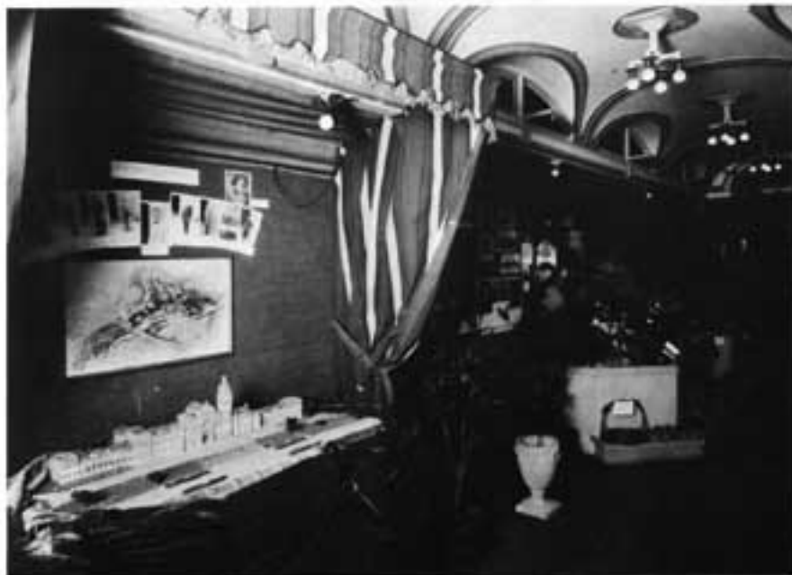
Cultural and educational exhibits included this model for the University of Miami building that was never built. A proposed plan for the campus hangs above it.